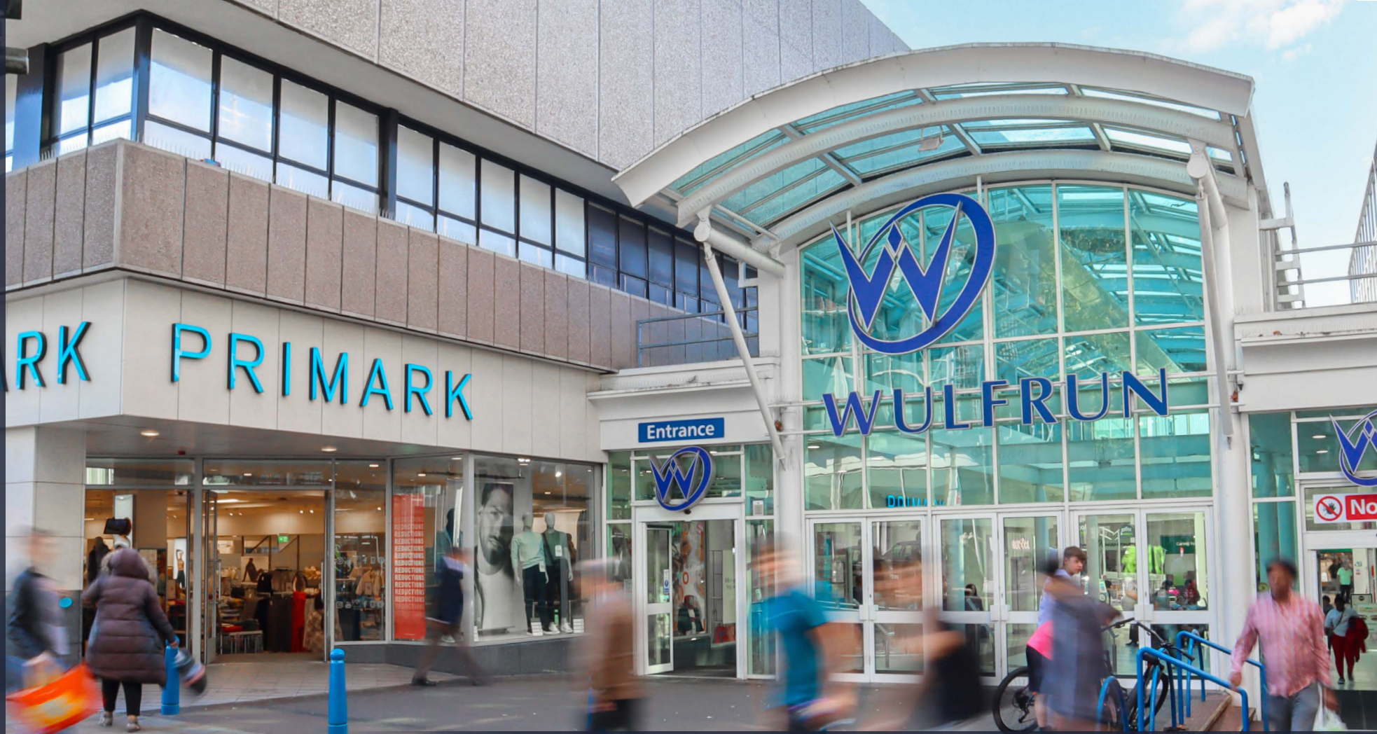
Wulfrun Shopping Centre, Wolverhampton, West Midlands WV1 3HH